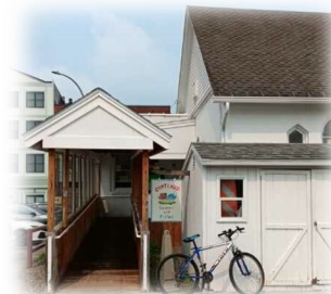
Loaves & Fishes entrance