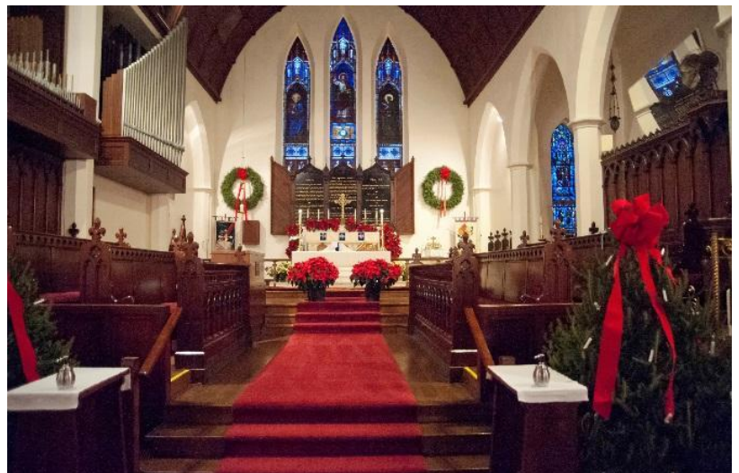
Click/tap photo for larger version

A beacon of light and a symbol of God's love stands majestically at 210 N. Cayuga Street in Ithaca, New York. Named after St. John, an apostle, author, fisherman, and beloved friend of Jesus, St. John's Episcopal Church has stood proudly on this site for 157 years. An Episcopal society was first formed in the Village of Ithaca in 1822, and its first church building was completed in 1824. In 1859, the original church structure was torn down, and the next year, a new and larger church was completed on the current site. Its Gothic style, brilliant white façade, and vibrant red front doors are striking, and create an easy landmark to find in Ithaca. The church stands at the intersection of North Cayuga Street and Buffalo Street in downtown Ithaca .