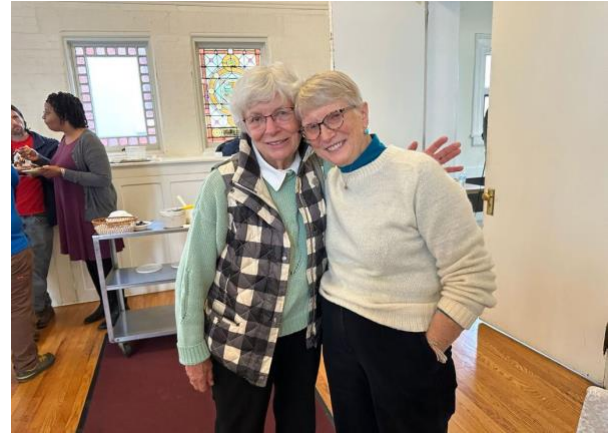
Click/tap photo for larger version

Click/tap photo for larger version facility includes a large nave and chancel, a large parish hall, a rector's office, a choir room, a children's chapel, the church office, several multi-purpose rooms, a commercial kitchen, and a parking lot directly behind the church. Due to the age of the church, several areas of the physical plant need repair, renovation, and replacement. In 2014, a successful capital campaign was launched to address issues vital to the well-being of our beautiful historic church. In the past few years, many of our planned capital improvements have been completed (click/tap the link to see " Capital Campaign Progress "). We praise God for blessing us with the resources and talents to be good stewards of our beloved church home.