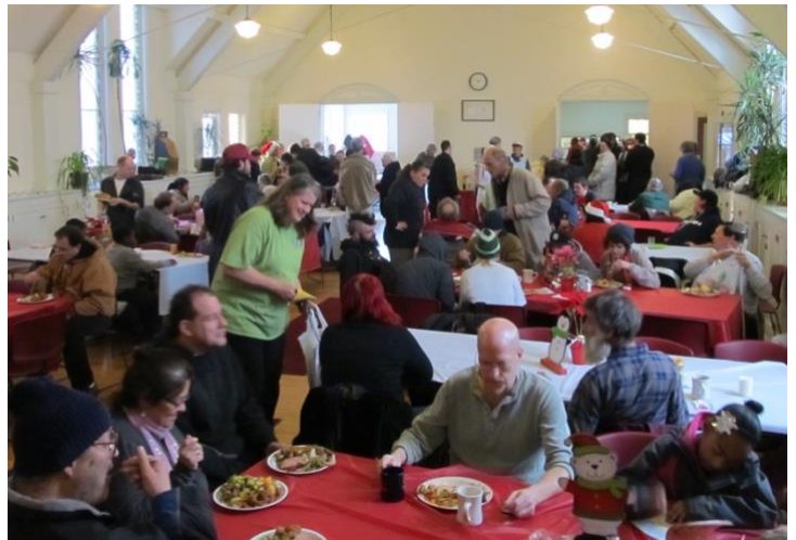
Click/tap photo for larger version

Inspired by our worship experiences, St. John's parishioners minister to the larger community. Our church is in the center of the Ithaca community, which allows us to have a central role in community service. For over 40 years, St. John's has hosted Loaves and Fishes of Tompkins County (see also the Loaves and Fishes Facebook Page ), which provides a place for free meals, hospitality, companionship, and advocacy for those in need, regardless of their faith, beliefs, or circumstances, where "All Are Welcome". This ministry began in 1983 and has served over 1.5 million meals in that time. Loaves and Fishes serves people who may be homeless, living in poverty, living with substance use or mental health issues, or lacking connections to family, friends, and resources. The needs of these vulnerable community members and the ways they sometimes manifest can be challenging, so providing understanding, compassion, and grace are just as important as providing the meal. Loaves and Fishes offers three lunches and two dinners per week. Additionally, Loaves and Fishes also utilizes a small office space in the church and occasionally uses other meeting space in the church. For a comprehensive description of Loaves and Fishes and its history, click/tap the link Ithaca Times Article .