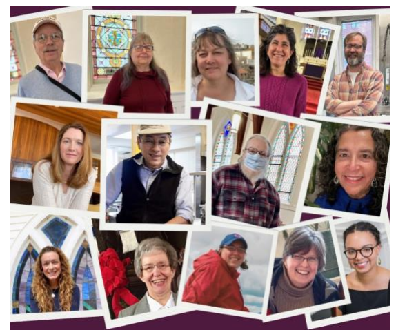
Click/tap photo for larger version with caption

There is a strong sense of community at St. John's. Love and care for others is a central theme. Parishioners give their time, talents, and resources to help church family members, address many needs in the greater Ithaca community, and participate in various ministries of the church. Parish special activities are well attended, and parishioners eagerly offer their assistance. Special care is given to welcoming visitors and new members to the church. There is obvious enjoyment in being able to greet one another in love during the Peace offering and at coffee hour after services.