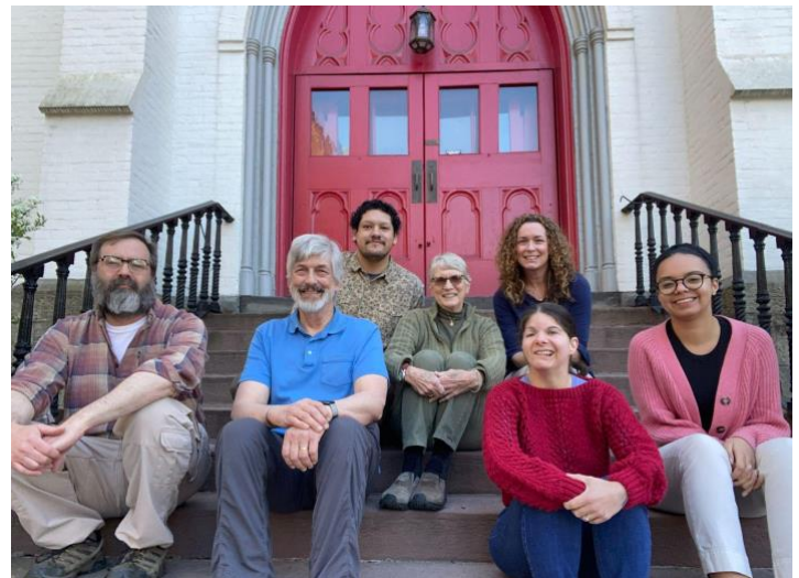
St. John's search committee members. Back row (left to right)

The 2024 Rector Search Survey (click/tap the link for a summary of the results) covered a few main areas: what parishioners value most in St. John's, the most important aspects of worship, what parishioners hope the future rector will bring as a leader and what their focus will become. The survey was primarily collected online. Paper surveys were also made available, and parishioners were invited to share feedback with search committee members during informal listen-and-learn sessions after the Sunday services. The survey was available for just over two weeks and received 53 responses. Committee members also interviewed several Loaves and Fishes staff and clients to get their perspectives.