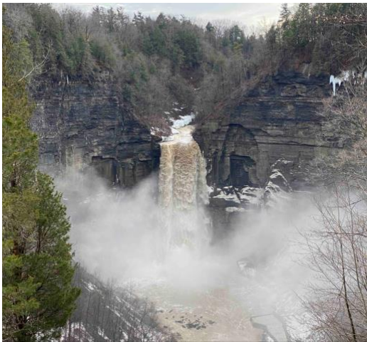
Click/tap photo for larger version

Tompkins County is 476 square miles in the heart of upstate New York. The county population in 2020 was 105,740 and according to 2024 labor data Tompkins County has one of the lowest unemployment rates in the state at 3.4%. (click/tap the link to see Department of Labor Local Area Unemployment Statistics ).