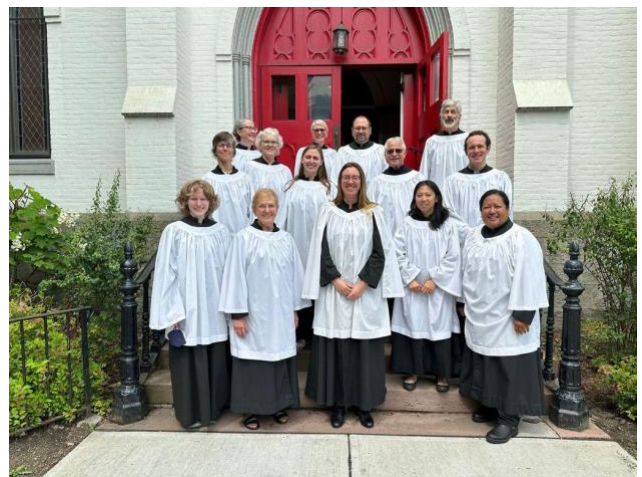
Click/tap photo for larger version